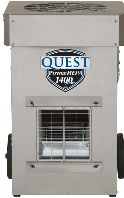
Quest PowerHEPA 1400 Pro