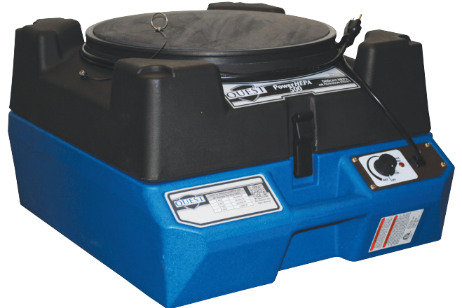
Quest PowerHEPA 500